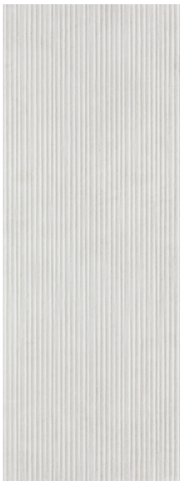
SAMPA FRIEZE OFF-WHITE

45x120 cm | 18"x48" [rectified] MA( MATTE )