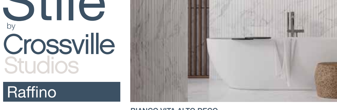
BIANCO VITA ALTO DECO

The classic design of premium matte marble surfaces has been reinvented in this sophisticated and dynamic collection inspired by the elegance of natural stone and a refined selection of three-dimensional surfaces. Light and shadows, veining and color meld together into a new and rich series designed to add character and interest to interior designs.