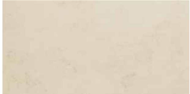
AV322 ▶ Penthouse