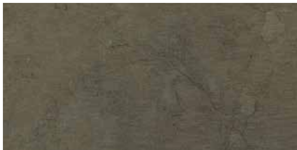
AV325 ▶ Dockside