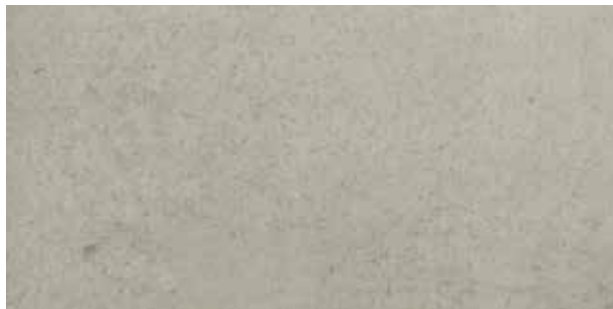
AV323 ▶ Clock Tower