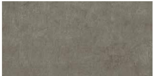
AV324 ▶ Mainline