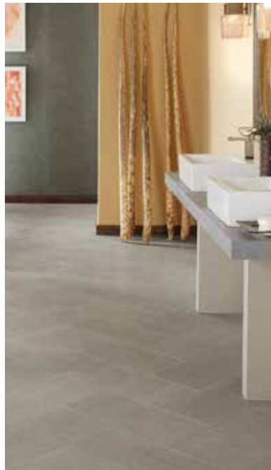
AV323 ▶ Clock Tower 12 x 24 L4338 ▶ Laminam by Crossville 5.6 Fokos - Piombo

Regular cleaning is the best way to keep Gotham® tile looking good for years to come. Use clean, hot water (combined with a household cleaner for more aggressive cleaning). Rinse thoroughly and dry with a soft cloth. No waxes are needed. More information regarding the care and maintenance of Crossville® products is available at CrossvilleInc.com .