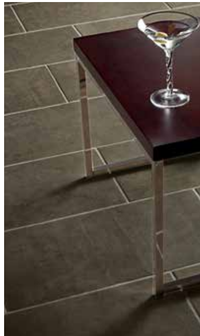
AV325 ▶ Dockside 12 x 24