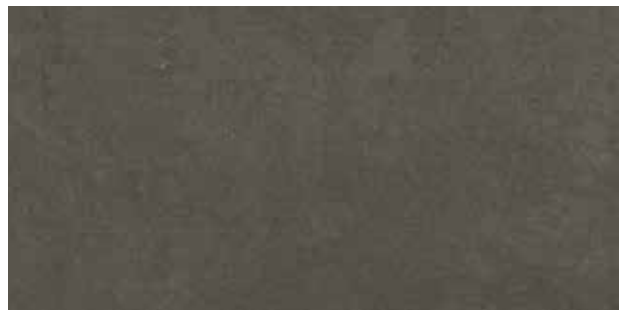
AV326 ▶ Pavement